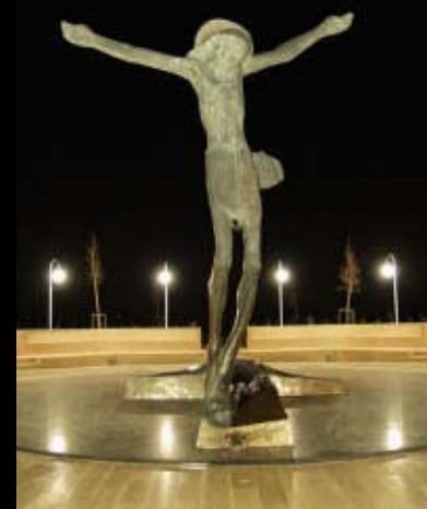
Statue of Risen Christ