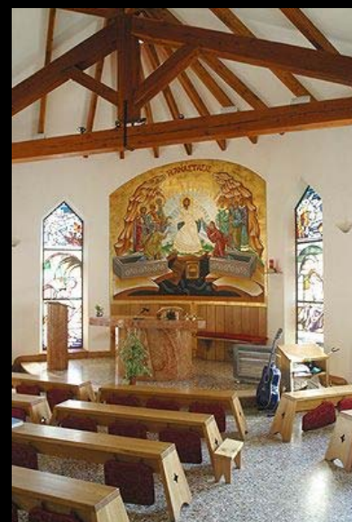
Chapel at Cenacolo Community