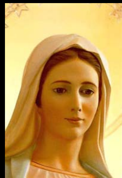
Statue of Our Lady