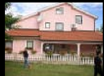
Learn More About The Dragicevic Family