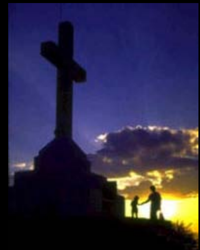
Krizevac Mountain, Medjugorje

2008 dates are now posted below -reserve early as we can Only * take 28 pilgrims MAKE A RESERVATION ON LINE