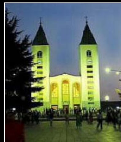
St. James Church